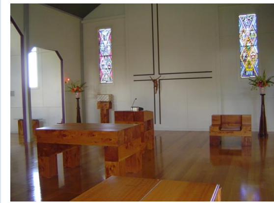
3 The Abbey Church