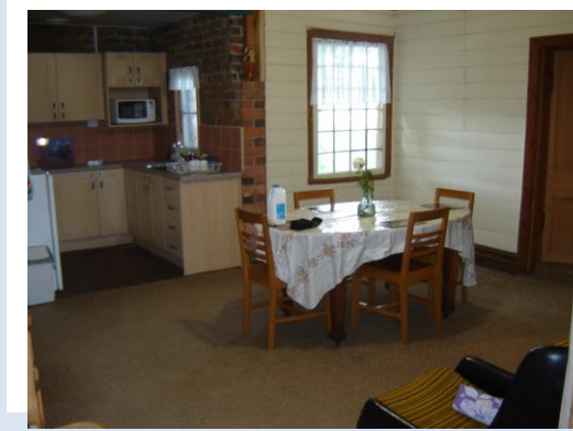
4 The Cottage