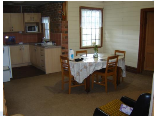
4 The Cottage