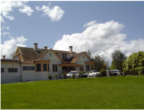
1 The Abbey Guesthouse