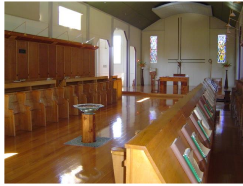
2 The Abbey Church