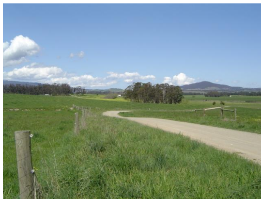
6 The Abbey farmlands