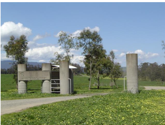
5 Entrance to the Abbey property