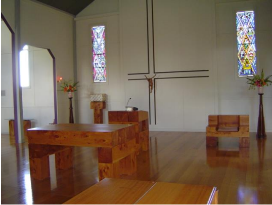
3 The Abbey Church