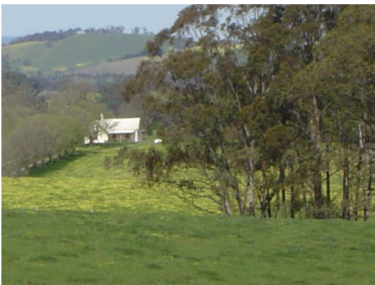
7 The Cottage