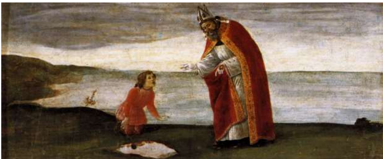
"The Vision of St Augustine" by Sandro Botticelli.