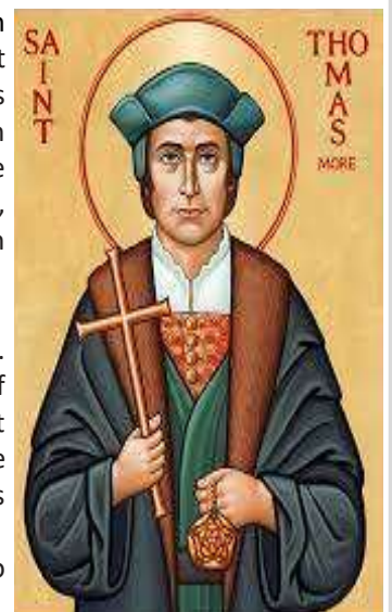
Thomas More (martyr)

Both were canonized saints on May 19, 1935, by Pope Pius XI. For all the baptized, both citizens and politicians, the stories of John Fisher and Thomas More are yet another reminder that faith cannot remain a private concern but must also animate our public lives of integrity. Saints John Fisher and Thomas More teach us that this can only come about through Christians with a courageous conscience, being faithful to truth and having a proper understanding of the relationship between church and state.