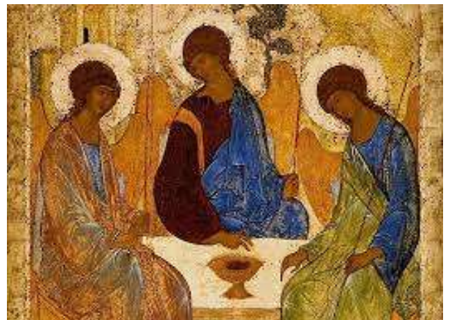
Holy Trinity (Troitsa). Andrey Rublev, 1425-1427

Antiphon from the Divine Office: Stanbrook Abbey