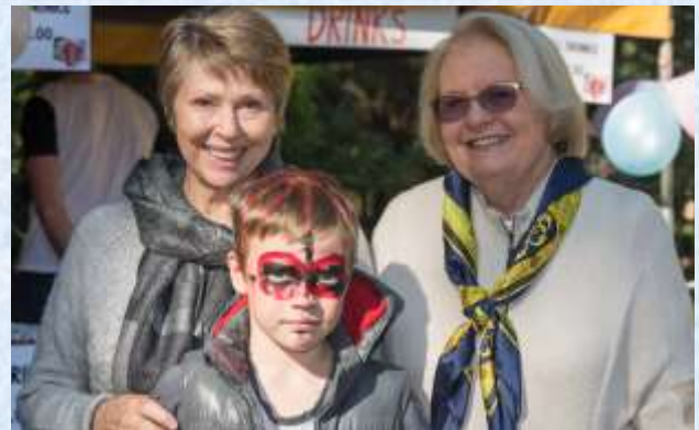
Holy Name Grandparents