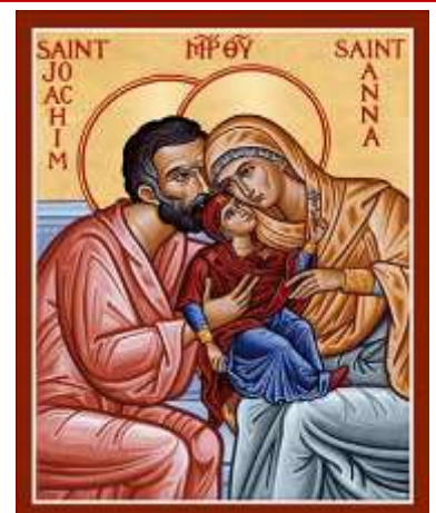
St Joachim and St Anne Parents of the Blessed Virgin Mary and Grandparents of Jesus

Mary, Mother of all the living, keep grandparents constantly in your care, accompany them on their earthly pilgrimage, and by your prayers, grant that all families may one day be reunited in our heavenly homeland, where you await all humanity for the great embrace of life without end. Amen.