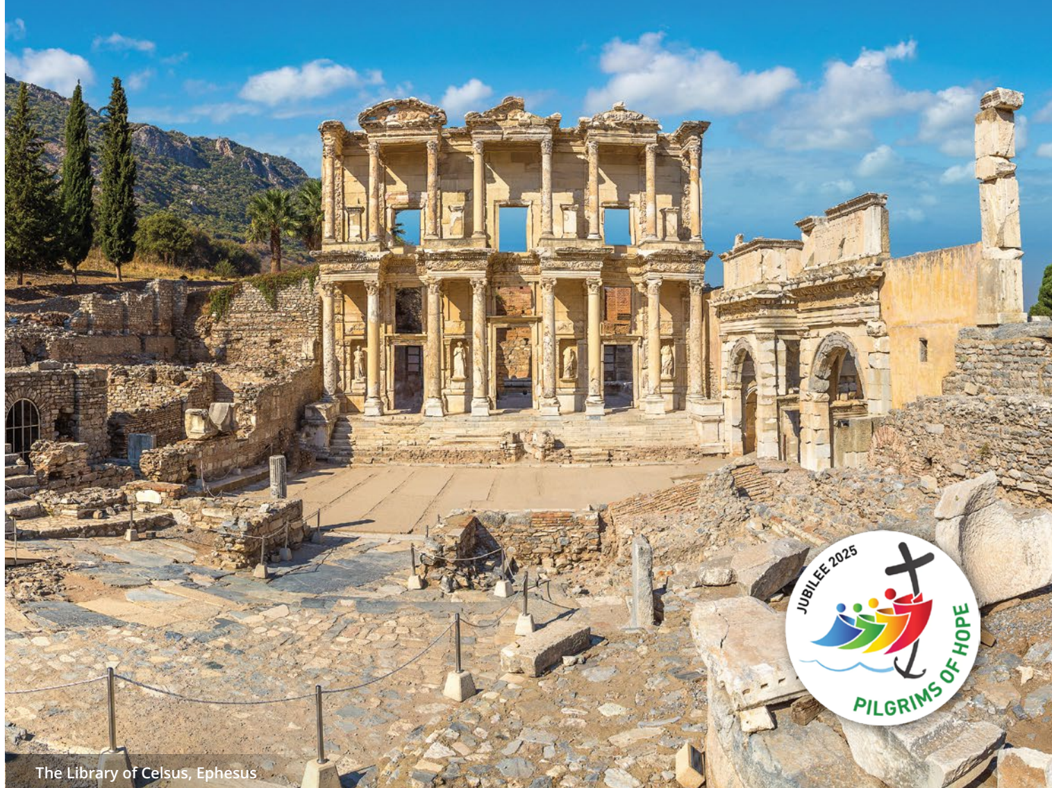
The Library of Celsus, Ephesus

Athens (2 nights) • Acropolis • Ancient Corinth • Kalambaka (2) • Meteora • Berea • Thessaloniki • Kavala (2) • Ancient Philippi • Patmos (2) • Samos (1) • Kusadasi (2) • Ephesus