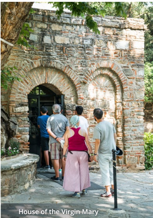
House of the Virgin Mary