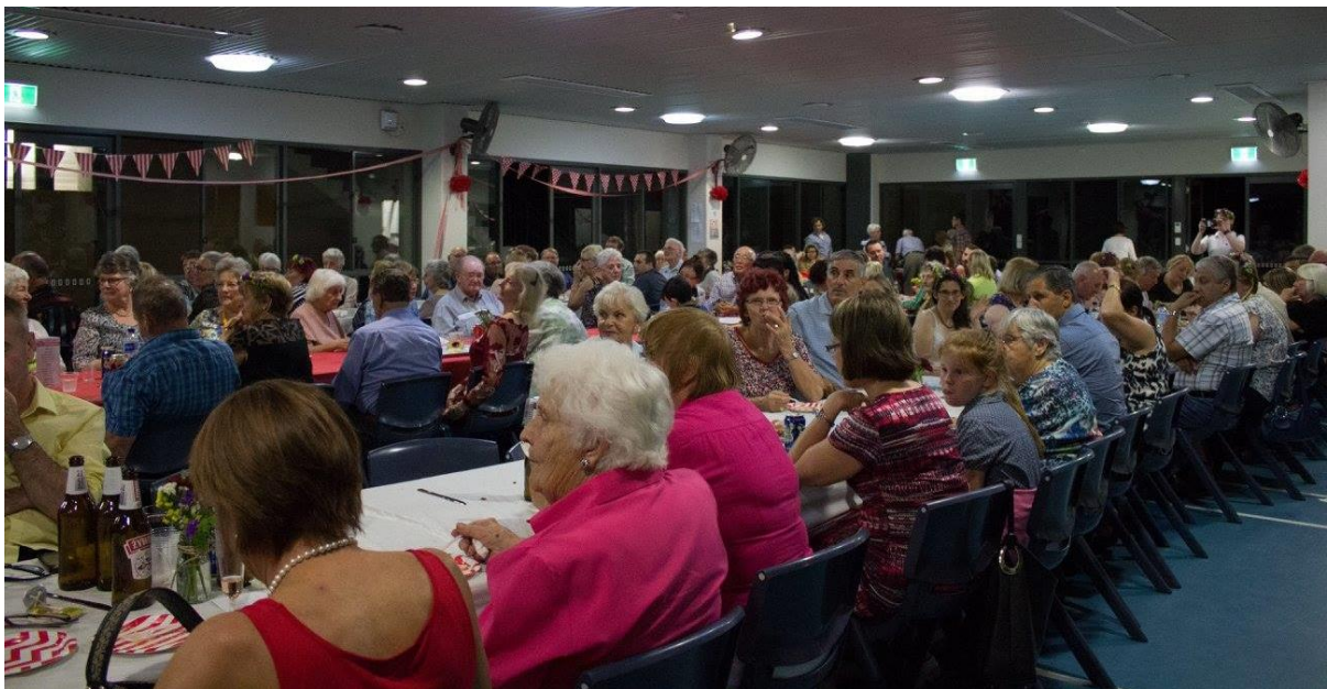
Photo – WYD Polish Dinner, April 2016 – St Patrick's Parish Gosford

This will ensure that the fundraising is successful on all fronts, not just financially.