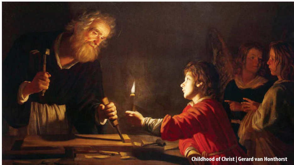
Childhood of Christ | Gerard van Honthorst

To foster deep devotion to Saint Joseph among Catholics, and in response to the "May Day" celebrations for workers sponsored by Communists, Pope Pius XII instituted the feast of Saint Joseph the Worker in 1955. This feast extends the long relationship between Joseph and the cause of workers in both Catholic faith and devotion. Beginning in the Book of Genesis, the dignity of human work has long been celebrated as a participation in the creative work of God. By work, humankind both fulfills the