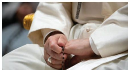
Prayers: Pope Francis prays the rosary at the Shrine of Our Lady of Divine Love in Rome in this May 1, 2018.

As the Church marks the Solemnity of Saint Joseph, POPE Francis asked Catholics to make a special effort in May to pray the Rosary, knowing that by doing so they would be united with believers around the world asking for Mary's intercession in stopping the coronavirus pandemic.