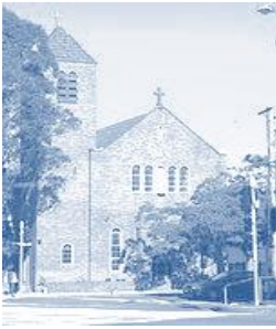
Holy Family Church 2 Highfield Rd, Lindfield