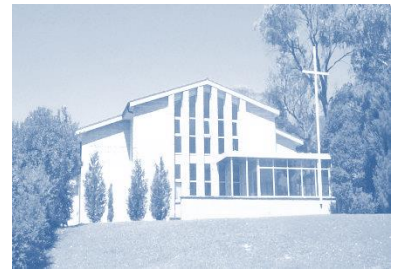
Immaculate Heart of Mary Church 76A Fiddens Wharf Rd, Killara