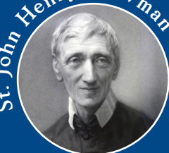
St. John Henry Newman

St John Henry Newman's encouragement, "Do not be afraid of holiness. It will take none of your energy, or life, or joy," echoes the Ordinariate's mission to evangelise through the beauty and depth of its liturgical life. It is a reminder that the pursuit of holiness, far from draining life's vitality, enriches it, offering a fullness of joy found in the love and service of God and neighbour.