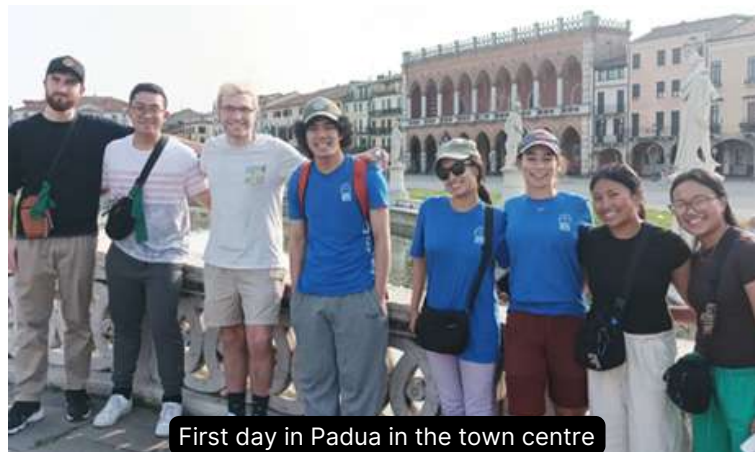
First day in Padua in the town centre

We also have Facebook groups for Antioch and Emmaus.