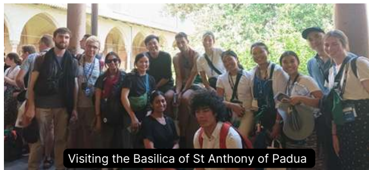
Visiting the Basilica of St Anthony of Padua