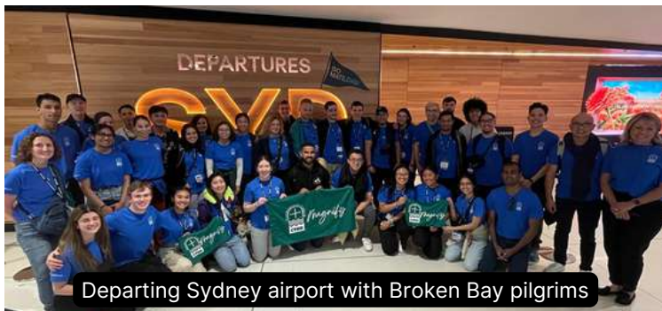
Departing Sydney airport with Broken Bay pilgrims

Our World Youth Day pilgrims have arrived safely in Italy! So many highlights already including visiting Venice, Padua, Ravenna, Bologna, Florence and we are about to travel to the gorgeous Assisi.