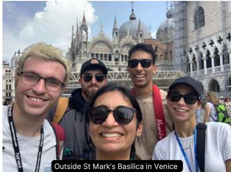
Outside St Mark's Basilica in Venice