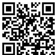
Eucharist QR Code

Once all forms are submitted, we will know the numbers we expect and can then advise you of the program dates.