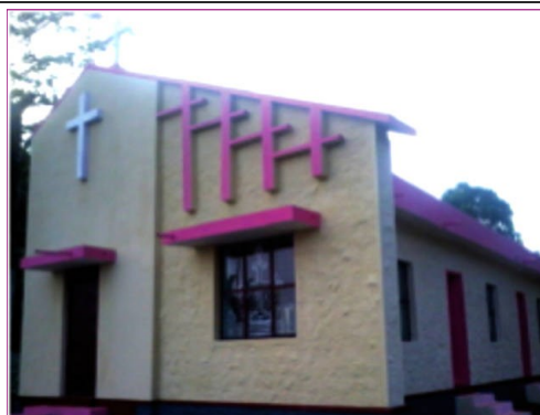
Style of church your generous donations will be put towards building in this remote area of Punjab, India by OSH Missionaries