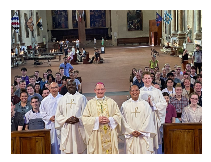
Vox Populi 27 July 2023

A pilgrimage is often referred to as a journey to a special place, perhaps a religious site, to pay one's respects, fulfill a promise to yourself or someone close.