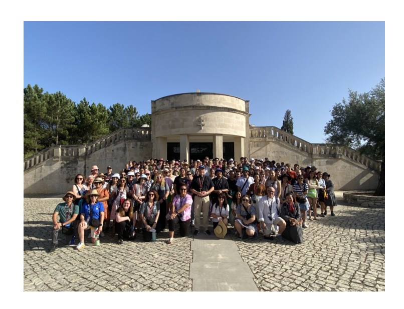
Vox Populi 11 August 2023