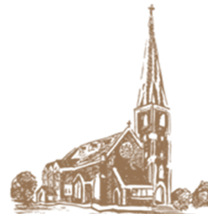
St Leonard's Naremburn

Twinning with the Parish of Letefoho, Timor Leste.