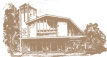
St Thomas' Willoughby