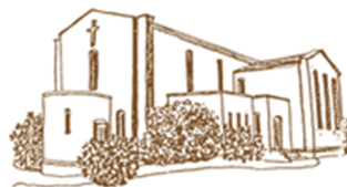
St Philip Neri Northbridge