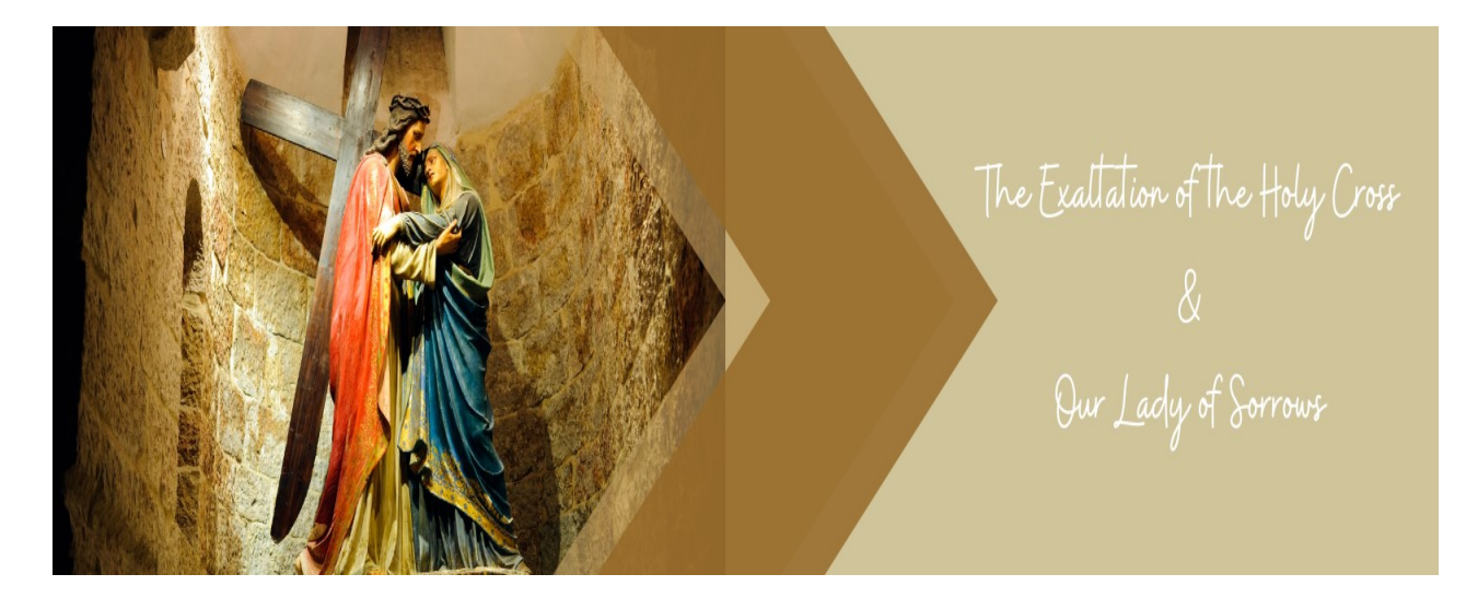
Vox Populi 14 September 2023

The one symbol most identified with Jesus and His Church is the cross. On Thursday, 14 September, we celebrate the feast of the Exaltation of the Holy Cross.