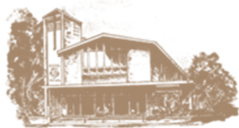
St Thomas' Willoughby