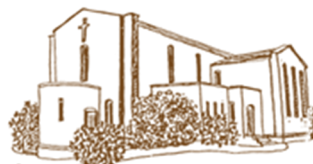
St Philip Neri Northbridge