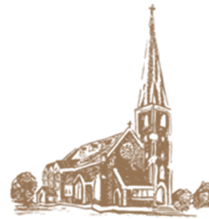
St Leonard's Naremburn

Twinning with the Parish of Letefoho, Timor Leste.