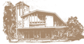
St Thomas' Willoughby