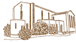
St Philip Neri Northbridge