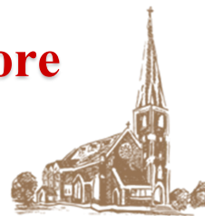
St Leonard's Naremburn

MISSION —'Together, in Christ's love, for others' VISION —'To know and love God, and to be Christ to one another'