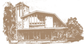
St Thomas' Willoughby