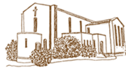
St Philip Neri Northbridge