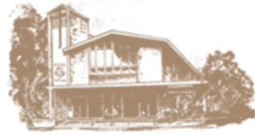
St Thomas' Willoughby