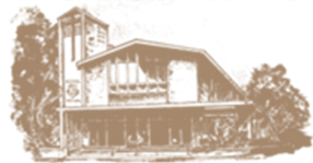
St Thomas' Willoughby