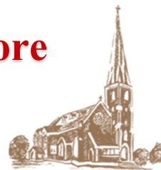
St Leonard's Naremburn

Twinned with the Parish of Letefoho, Timor Leste.