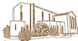
St Philip Neri Northbridge