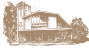
St Thomas' Willoughby