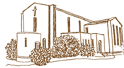
St Philip Neri Northbridge